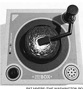
PAT MYERS/THE WASHINGTON POST

THE STYLE CONVERSATIONAL The Empress's weekly online column discusses each new contest and set of results. Especially if you plan to enter, check it out at wapo.st/styleconv.